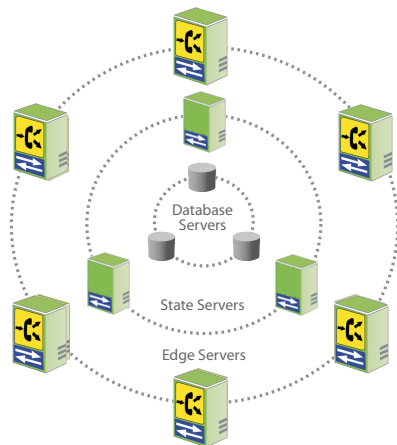
Server clustering for scalability and fault tolerance.

Eyeball provides a one-stop solution that combines client and server software for rapid development and deployment of VoIP services. This includes soft-client or soft-phone (Messenger or custom applications), IM server, SIP Proxy Server and AnyFirewall Server (for STUN and TURN) complete with web-tools for customer portal and service administration. Eyeball solutions have been field-proven since 2003 with over 19 million subscribers and 10 billion VoIP call minutes.